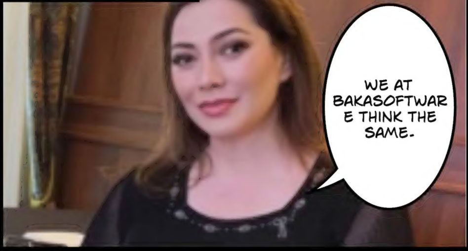
MEANWHILE AT CONTI RANSOMWARE HQ---